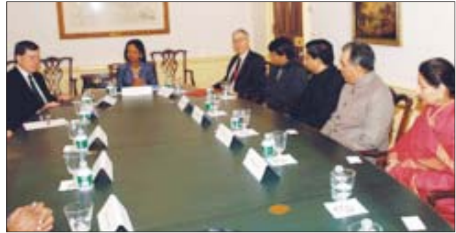
The nine-member multi-party delegation of Indian parliamentarians at their meeting with U.S. Secretary of State Condoleezza Rice in Washington, D.C., on May 3.

Following the New York visit, the delegation visited Washington, D.C., where they met U.S. Secretary of State Condoleezza Rice and Deputy National Security Adviser J.D. Crouch. Rice discussed Indo-U.S. relations and spoke specifically about the civil nuclear deal. She reiterated that whatever agreement goes through would be within the framework of the July 18, 2005, agreement. Rice also expressed the hope