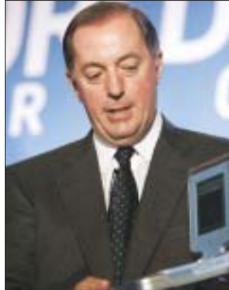
Chief Executive Officer, Intel Corporation, Paul Otellini displays Intel's new device — Eduwise — at a press conference in Bangalore on May 23.

Union IT and communications minister Dayanidhi Maran has been persuading Intel to set up a chip fabrication plant or an ATMP unit, which is estimated to cost about $400 million, according to industry analysts. ■