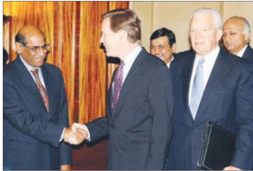
Foreign Secretary Shyam Saran with U.S. Under Secretary of State Nicholas Burns at India House in London on May 25.