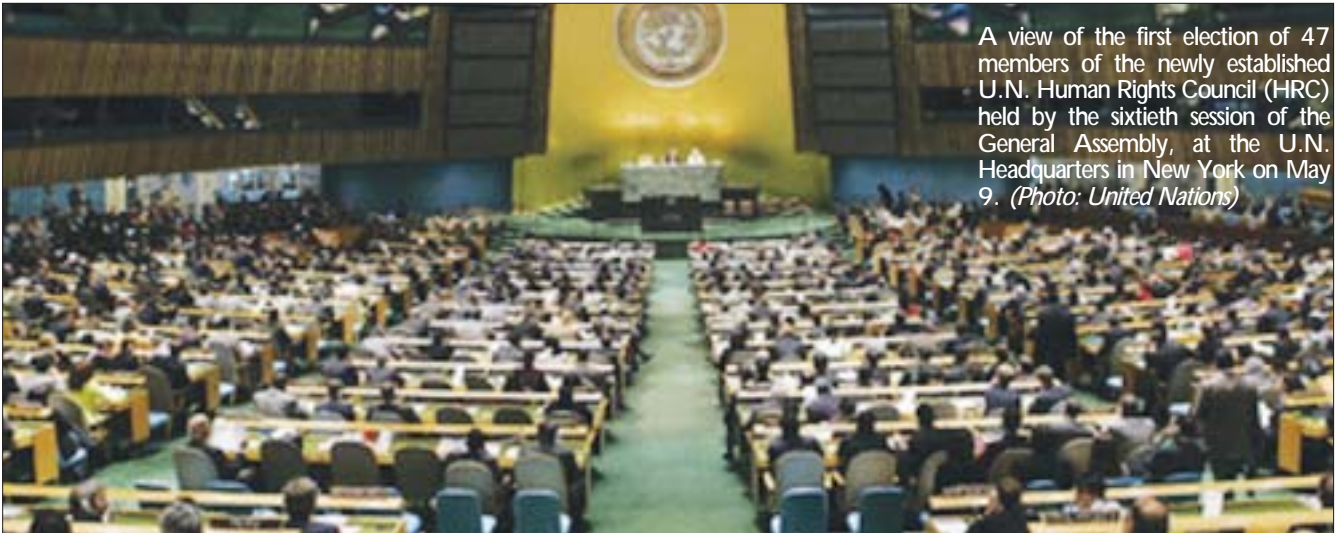
A view of the first election of 47 members of the newly established U.N. Human Rights Council (HRC) held by the sixtieth session of the General Assembly, at the U.N. Headquarters in New York on May 9.