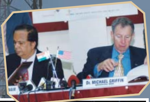
NASA Administrator Michael Griffin and ISRO Chairperson G. Madhavan Nair sign MoU