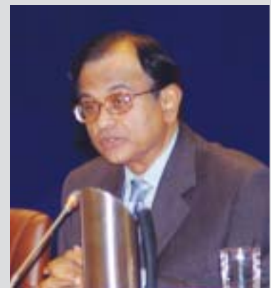
Union Finance Minister P. Chidambaram addressing the concluding session of the 39th Annual General Meeting of Board of Governors of Asian Development Bank in Hyderabad on May 4.

A recent World Investment Report has ranked India as the second-most attractive investment destination among transnational corporations. ■